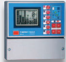
Data Logger, Alarm & Controller SMX100