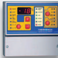
Controller & Alarm Coltrec RCX100 Controller

Please contact us for further information.