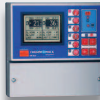
Data Logger & Alarm SM Range – SM Due, Quattro & SM12